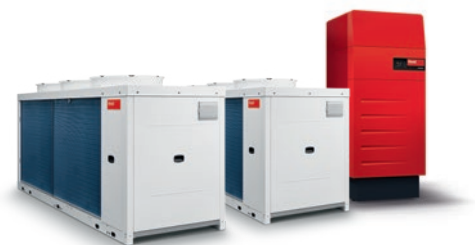
Bivalent hybrid system with Belaria® fit and gas condensing boiler UltraGas®.

With Belaria® fit, efficient systems with a high proportion of renewable energies can be planned. As a monovalent system, up to 1.4 MW is possible. Bivalent hybrid systems can even supply up to 4 MW – depending on the required proportion of renewable energies.